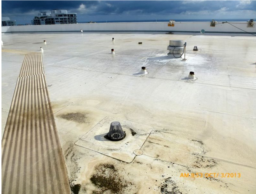
Membrane Roof Covering