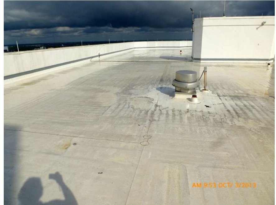
Membrane Roof Covering